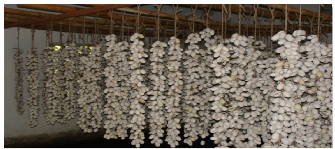
Fig. 3: The garlands prepared for nucleus seed cocoon preservation.

called Jeevan Sudha once per instar, twice per second, and three times per instar of the silkworm larvae. In order to identify the pebrine spores during microscopic examination in silkworms, a rigorous three-tier mother moth examination was conducted in tasar grainages using the Pebrine Visualization Solution (PVS). In addition, garlands made of Seed cocoons were kept in the grainage hall. Using jute thread at the tips of the peduncles, garlands made from both male and female cocoons (60:40) were prepared (Fig. 3). To make cleaning the floor easier, the garlands were hung two feet above the floor.